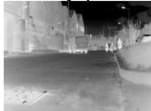
Thermal image by ZnS Lens